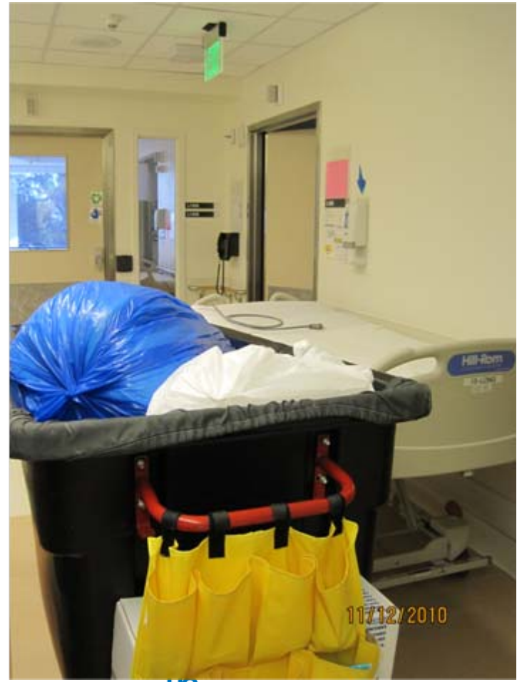
UCSF Benioff Children's Hospital