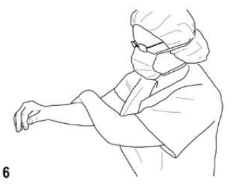
See legend for Image 3