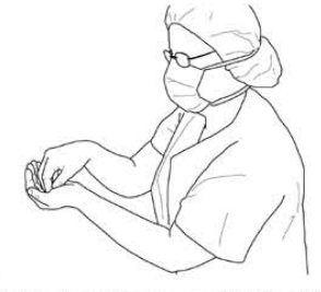
Dip the fingertips of your right hand in the handrub to decontaminate under the nails (5 seconds)