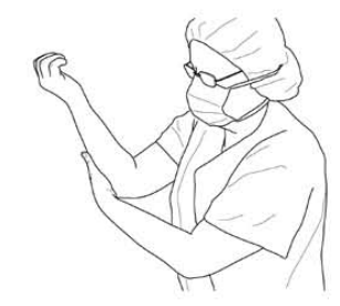
See legend for Image 3