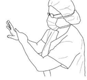
Images 3–7: Smear the handrub on the right forearm up to the elbow. Ensure that the whole skin area is covered by using circular movements around the forearm until the handrub has fully evaporated (10-15 seconds)