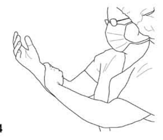
See legend for Image 3