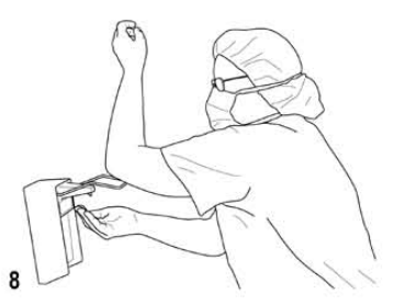
Put approximately 5ml (3 doses) of alcohol-based handrub in the palm of your right hand, using the elbow of your other arm to operate the dispenser