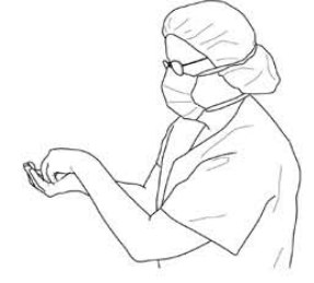
Dip the fingertips of your left hand in the handrub to decontaminate under the nails (5 seconds)