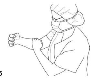
See legend for Image 3